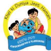
Kristu Jyoti Kindergarten